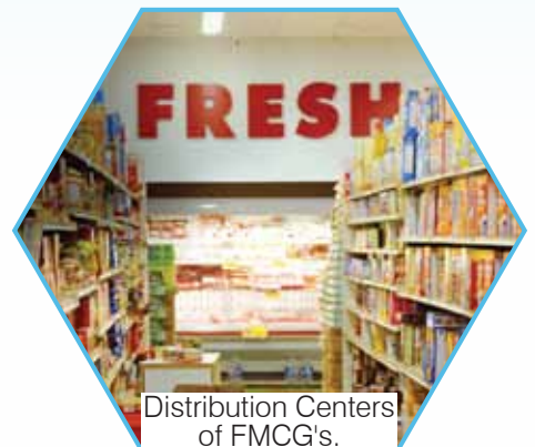
Distribution Centers of FMCG's.